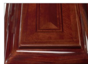
| Inlaid Marquetry Detailing |