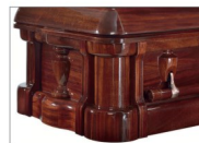
| Traditional Craftsmanship |